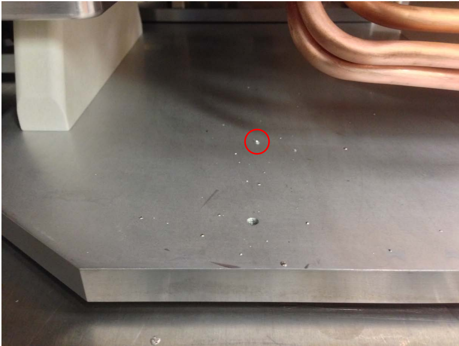
Figure 3: Solder splash marks on the Source Tray base plate