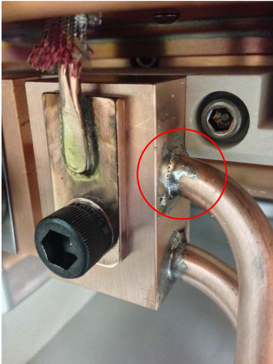
Figure 2: Close up of the solder site on the left coil line. Coil connected. Leak site circled.