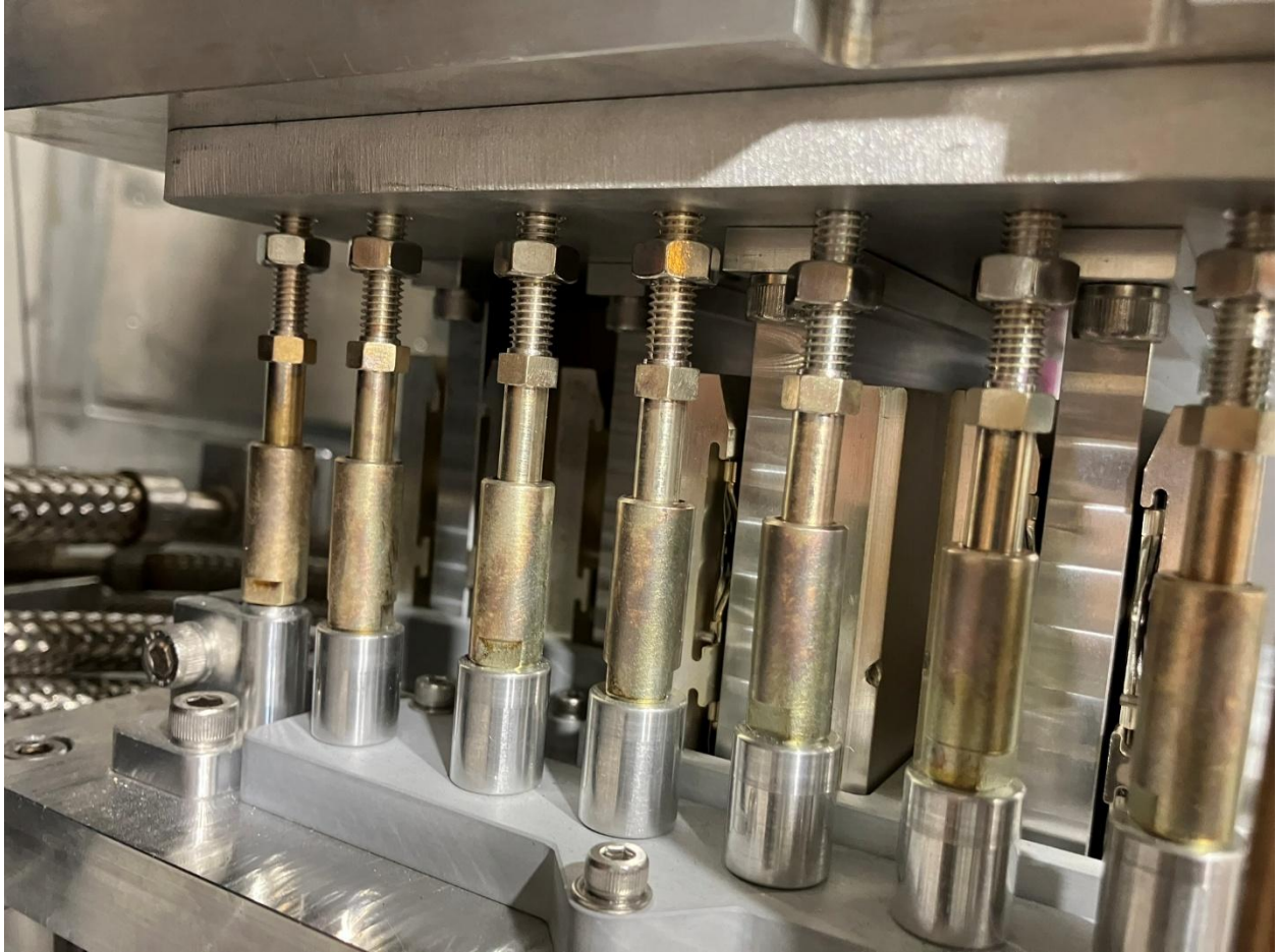
All pins self-guide into the sockets.