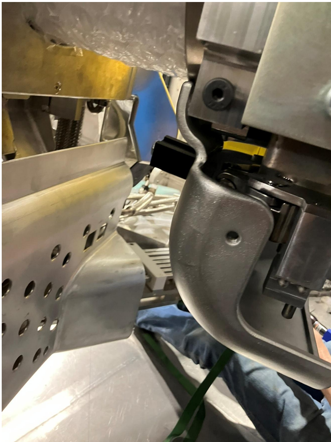
Rear manipulator handle accessed from this orientation, made horizontal.