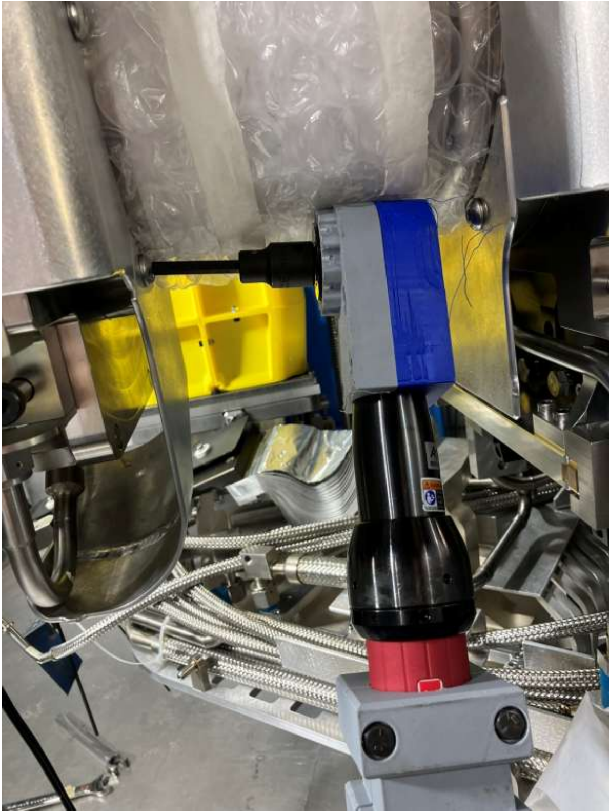
Torque tool interference when accessing HV shielding for this hanging VCR joint.