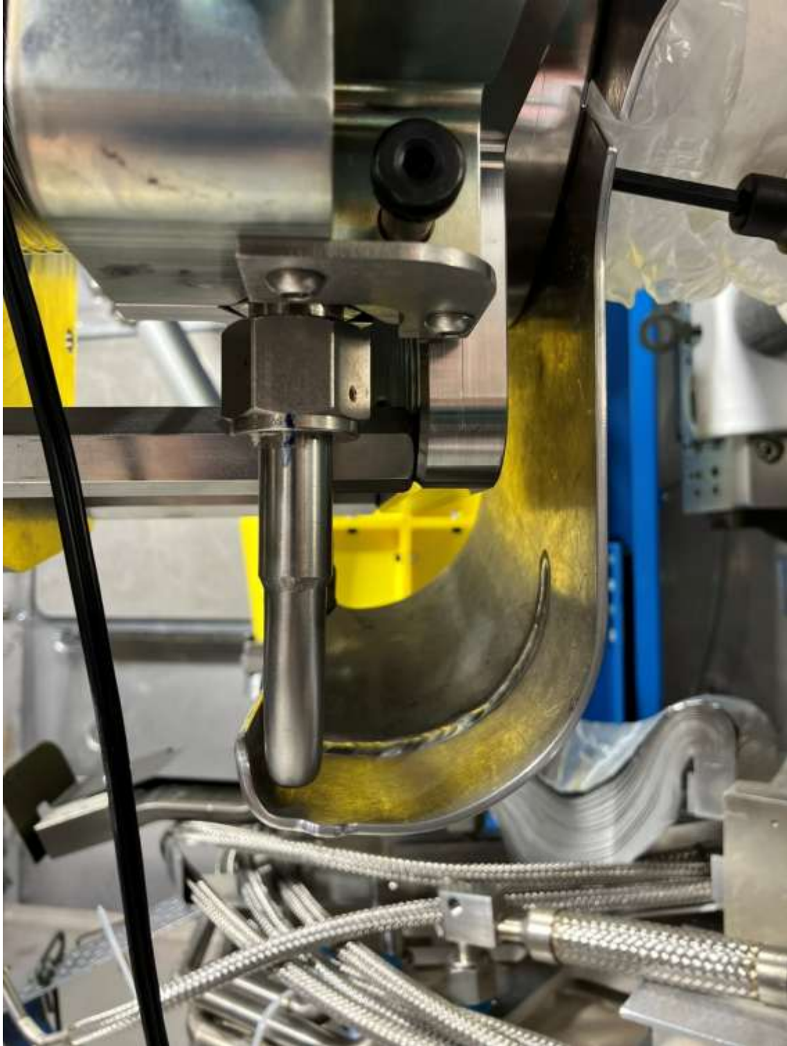
Joint successfully re-done by hand, no need for manipulator testing.