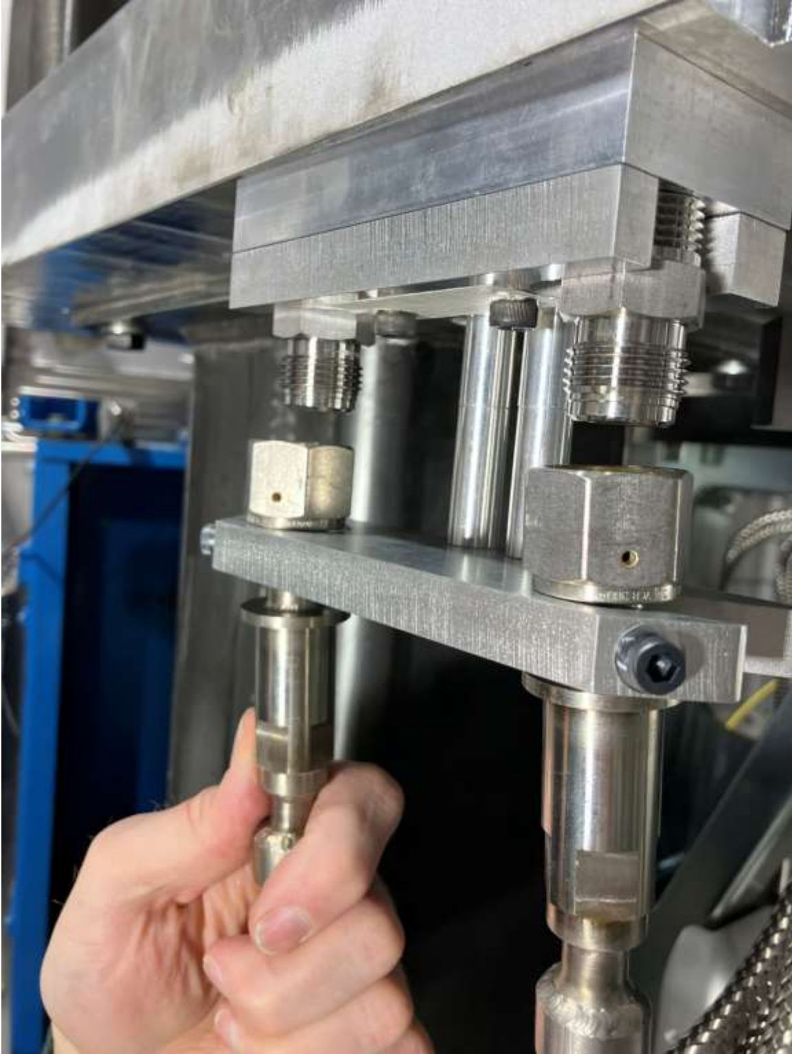
Bracket issue requires improper mounting of the female VCR side.