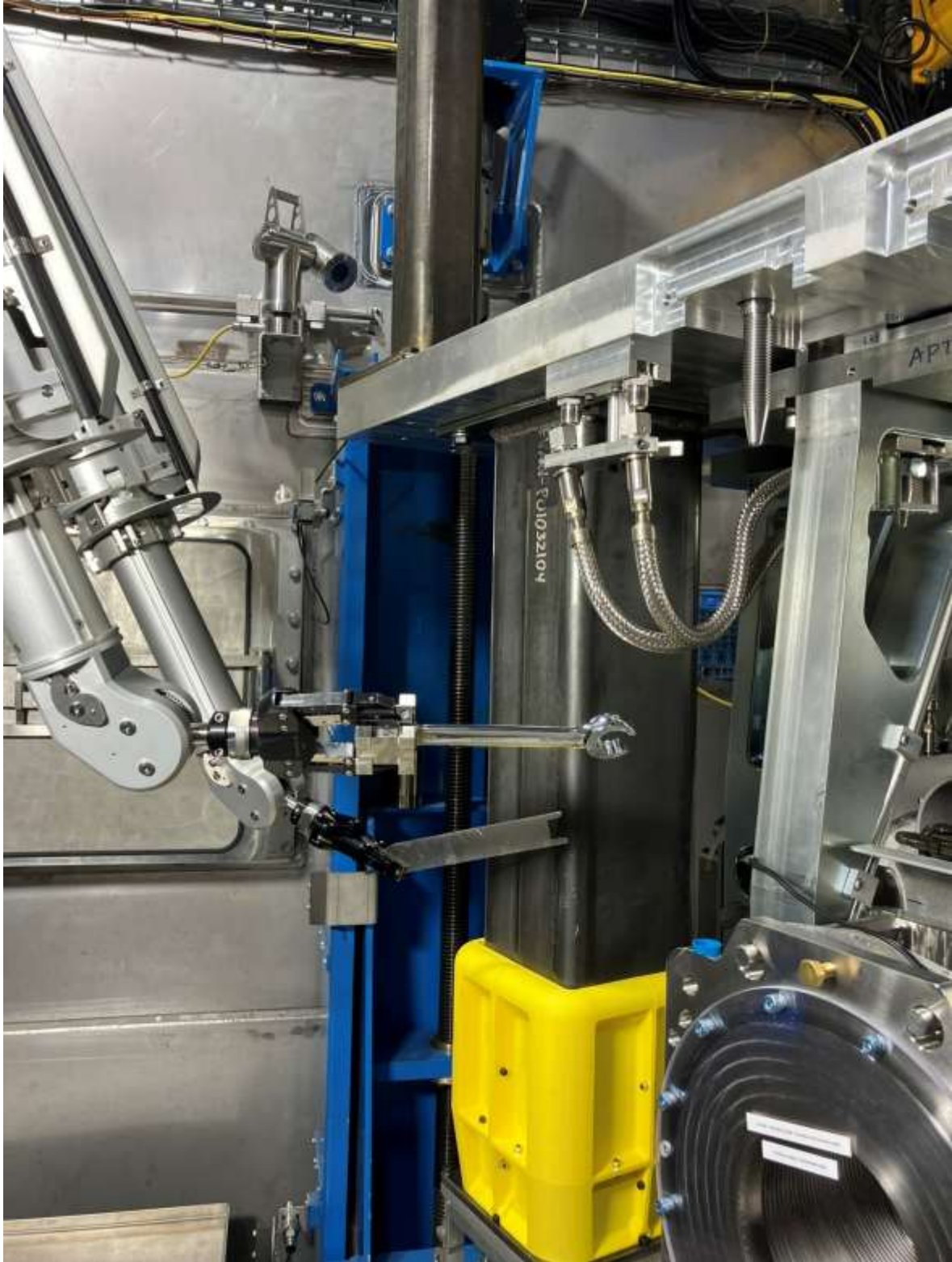
Successful positioning of the flexible lines on the upper driver side with manipulators into bracket.